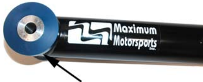
Urethane at Chassis End ONLY

Note: The axle end of the control arms DO NOT need the Control Arm Urethane pieces.